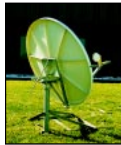
Back View 1.2M Rx/Tx

Prodelin Corporation is the world's largest manufacturer of Rx/Tx VSAT antennas. We have the broadest product line in the industry including Receive Only, Rx/Tx and Rural Telephony antenna systems. Prodelin offers nineteen antenna sizes, 47cm to 4.5M. Prodelin is the leader in obtaining type certifications and approvals for Intelsat, AsiaSat and Eutelsat. Prodelin antennas provide the best quality in the market due to the sophisticated, precision SMC compression molding process technology. Prodelin provides the best value antenna solution to the market with competitive prices, the highest quality products and superb engineering support. Prodelin is ISO registered, KEMA # 70022.01. Prodelin - The Market Leader in VSAT Antennas.